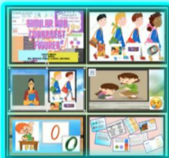
SIMILARITY IN CONGRUENCY

After extensive research and planning, concepts such as angles, notice writing, figures of speech, stories, value oriented Sanskrit stories etc were identified and significant graphics tales were created by the students and teachers alike.