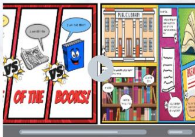
BATTLE OF BOOKS