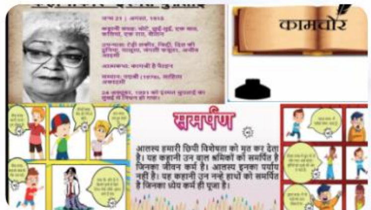
STORY OF A STORY TELLER- Ismat Chughtai