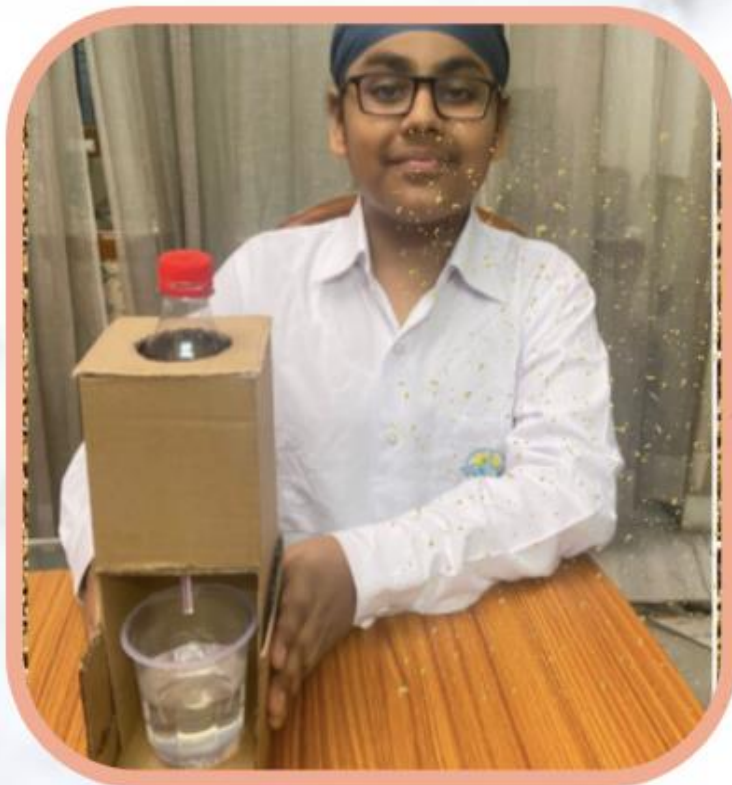
Desktop Water Dispenser