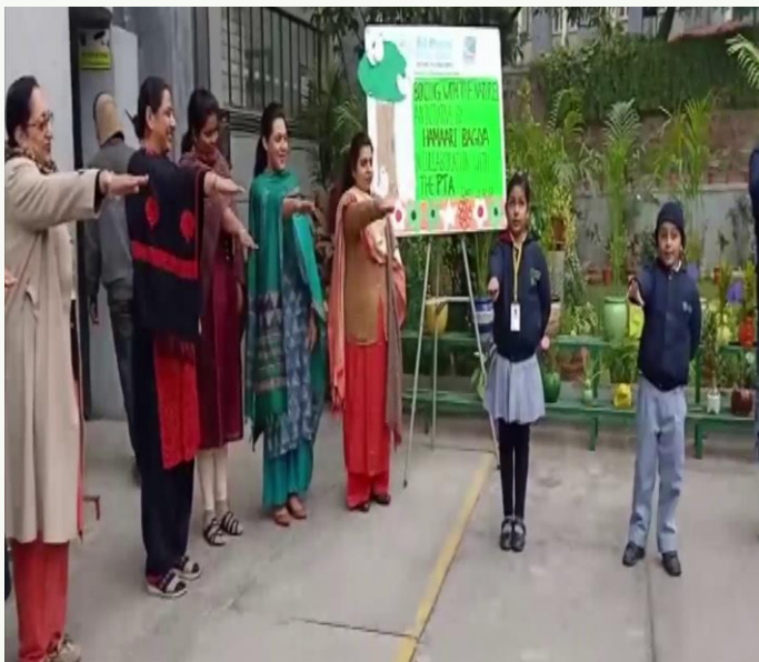
Pledge taking ceremony to protect and nurture plants