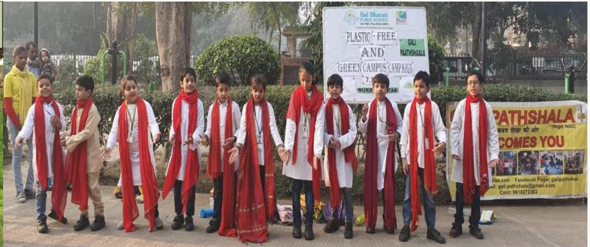
Nukkad Naatak in the neighbourhood