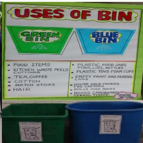
Waste Segregation- Dry and Wet